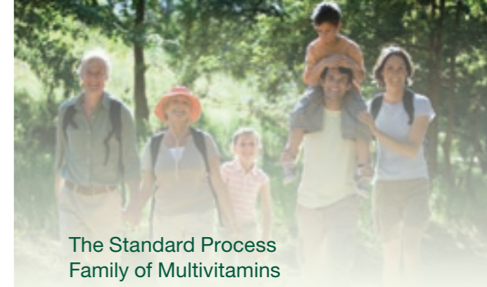
The Standard Process Family of Multivitamins

These statements have not been evaluated by the Food and Drug Administration. These products are not intended to diagnose, treat, cure, or prevent any disease.