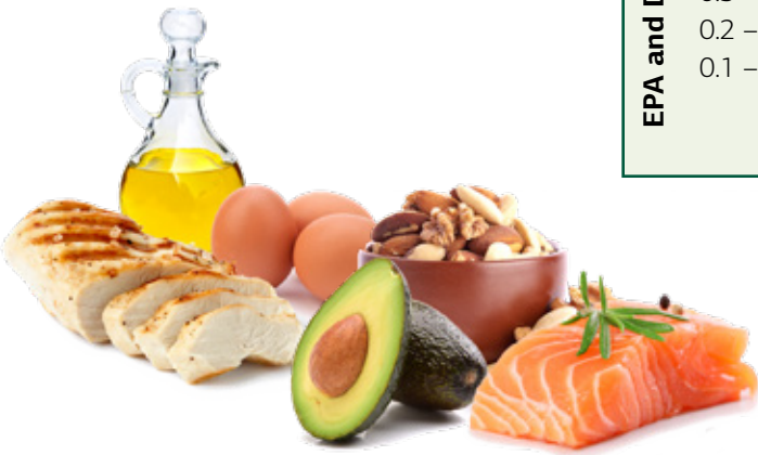
FIGURE 1. Intake of omega-3 does not meet the recommended level of intake 11,12,13,14

Increasing omega-3 fatty acid consumption through foods is preferable. However, a large percentage of the US adult population falls below the recommendations for omega-3 fatty acid consumption. 3 Supplements can help bridge this gap.