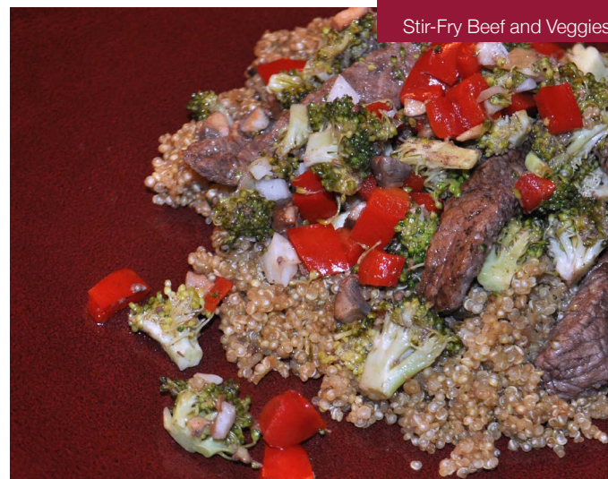
Stir-Fry Beef and Veggies

In a large skillet, heat oil. Add all remaining ingredients and cook for 8-10 minutes or until softened to desired tenderness. Serve over quinoa. Serves 2-4.