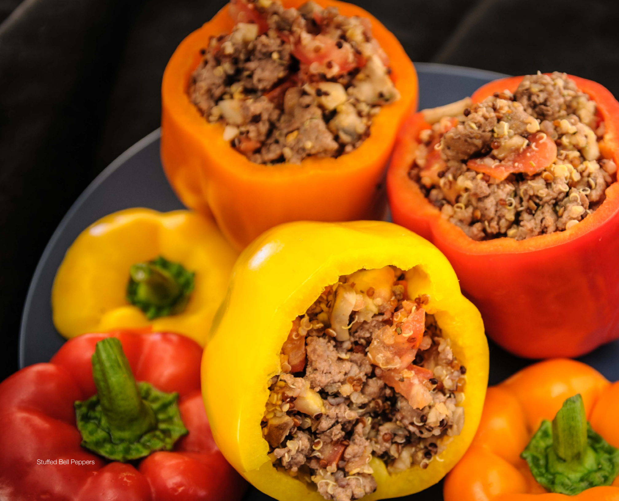
Stuffed Bell Peppers