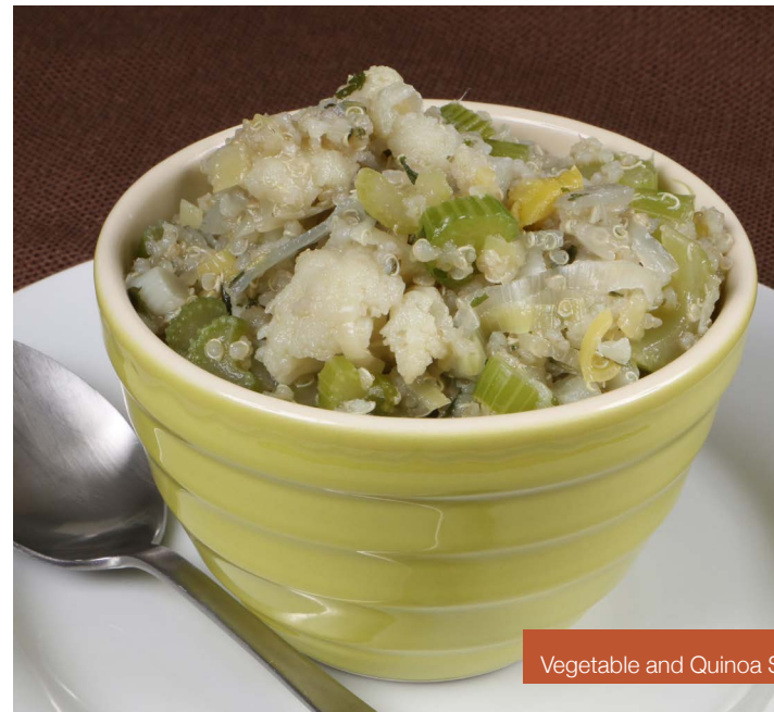
Vegetable and Quinoa Soup

Preheat oven to 350 F. Rub potatoes with 1 tablespoon olive oil and place on baking sheet. Wrap a head of garlic in aluminum foil and place on baking sheet with potatoes. Bake for 30 minutes or until potatoes are soft. Heat remaining oil in a medium sauté pan with the onion until onion is translucent, about 3 minutes. In a blender or food processor, add onion, garlic, and about half of the potatoes. Purée mix thoroughly. Transfer to a large soup pan and add all remaining ingredients. Heat to a boil, then lower heat and allow to simmer for about 15 minutes. Serves 4.