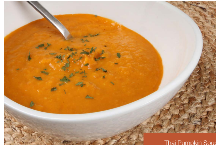
Thai Pumpkin Soup

Sauté onion in olive oil until soft. Add tomato paste, pumpkin, ginger, garlic, and broth. Combine until thoroughly heated and place in blender. Add chilies, coconut cream, coconut milk, and lemon juice. Blend for 30 seconds. Season with sea salt and pepper to taste. Serve immediately. Note: If a less sweet soup is desired, omit coconut cream and increase coconut milk to 1½ cups. Serves 2-4.