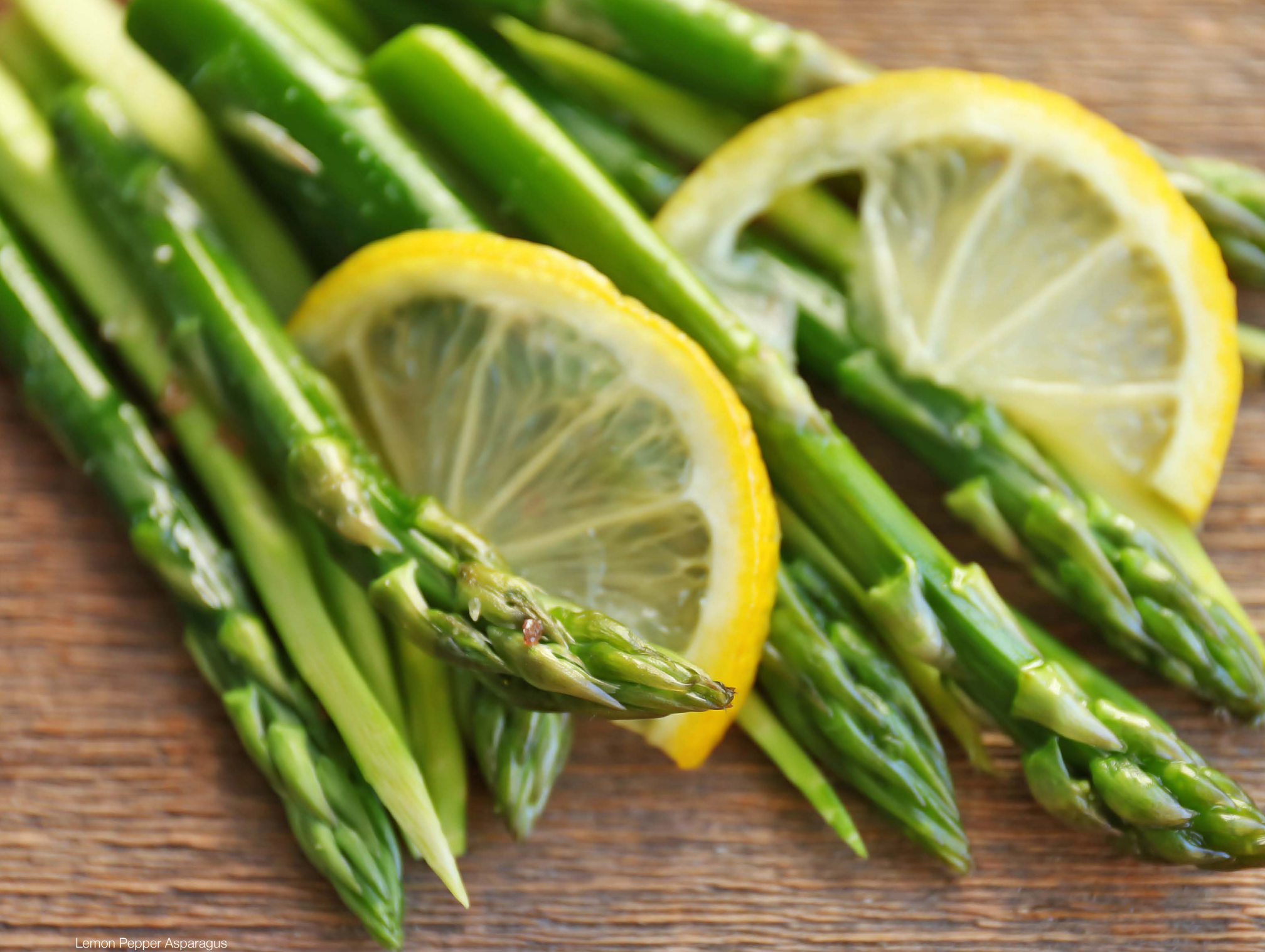
Lemon Pepper Asparagus