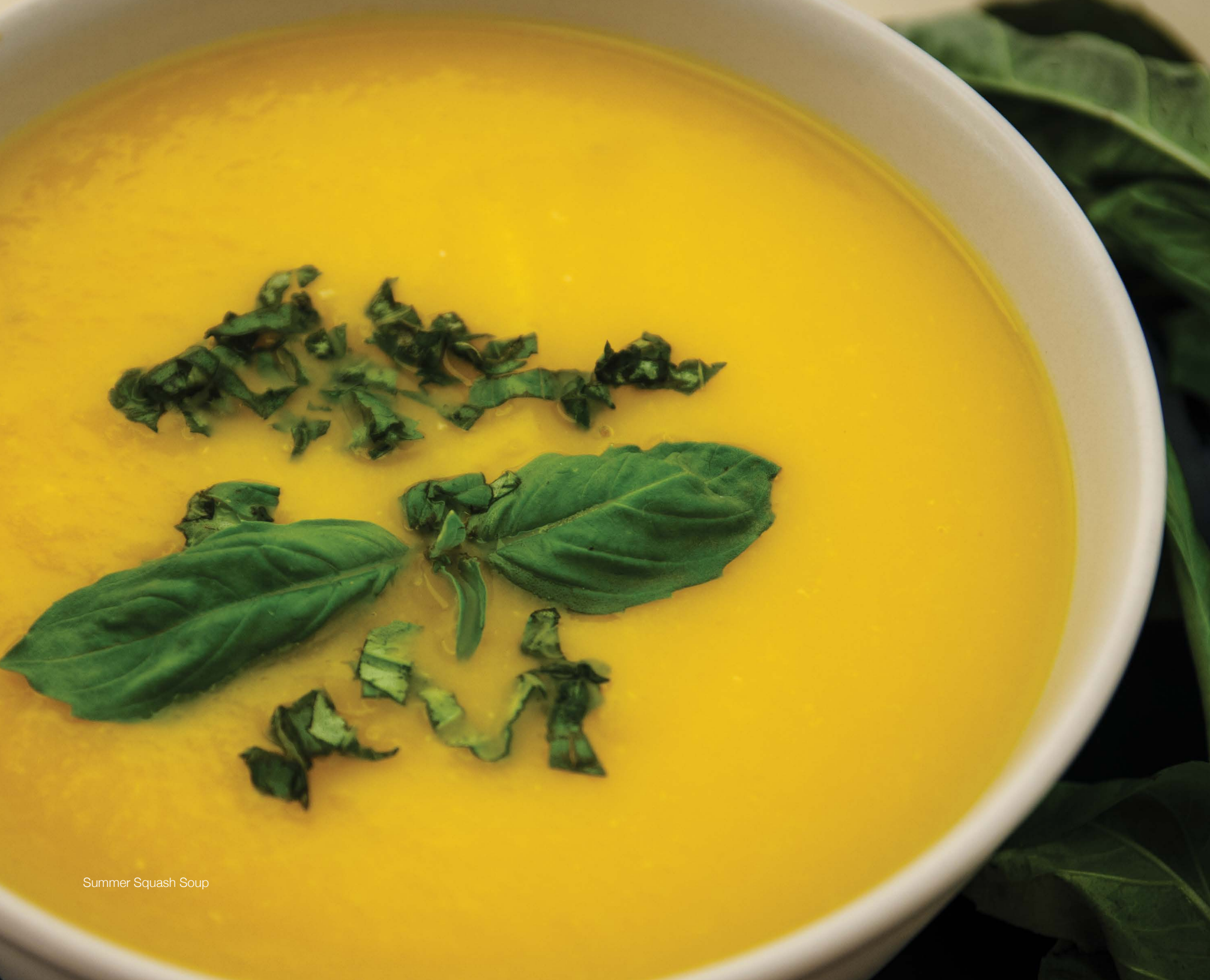
Summer Squash Soup