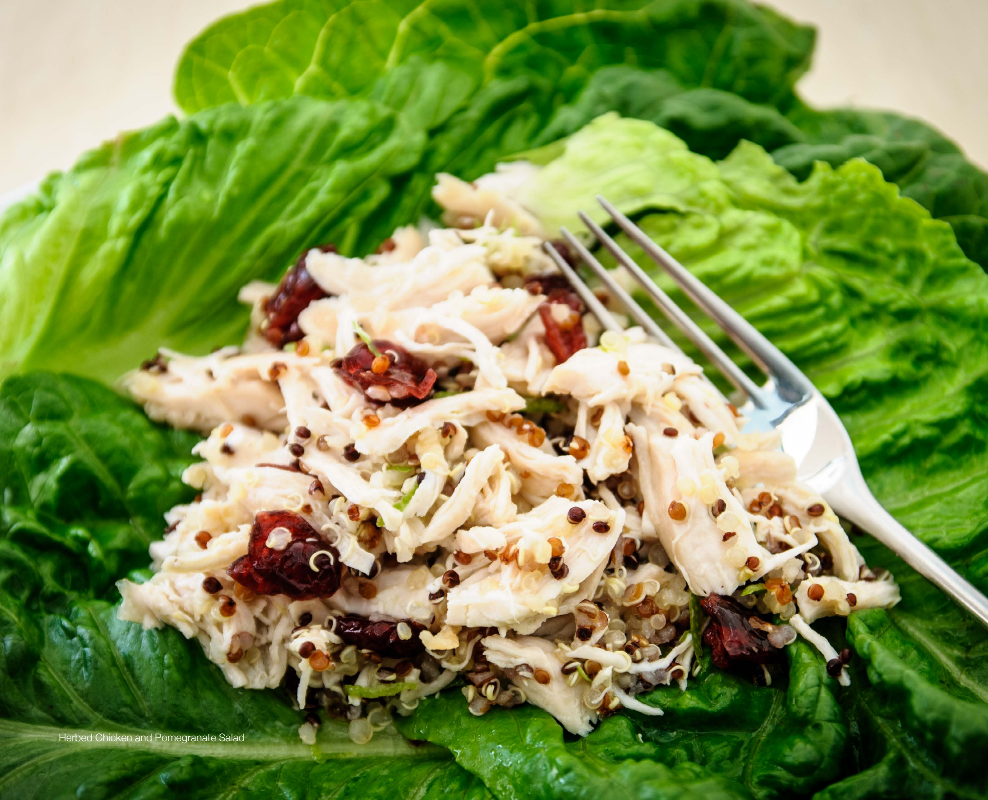
Herbed Chicken and Pomegranate Salad