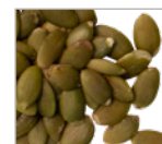
Organic Pumpkin Seeds